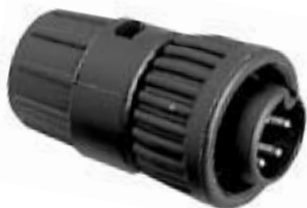
Cable Pin 6X8X-XPB-XXX Matching Mates: • Cable-Cable 8X8X-XSB-XXX • Panel 7XXX-XSB-XXX