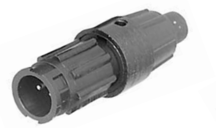
Cable to Cable 1828X-XXB-XXX Matching Mates: • Cable Pin 1628X-XPB-XXX • Cable Socket 1628X-XSB-XXX