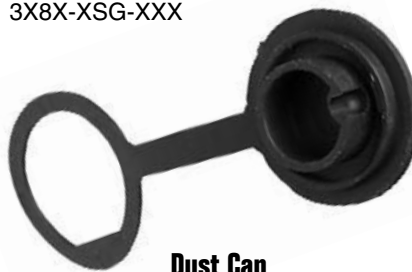
Dust Cap 4295