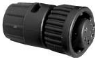
Cable Socket 6X8X-XSB-XXX Matching Mates: • Cable-Cable 8X8X-XPB-XXX • Panel 7XXX-XPB-XXX