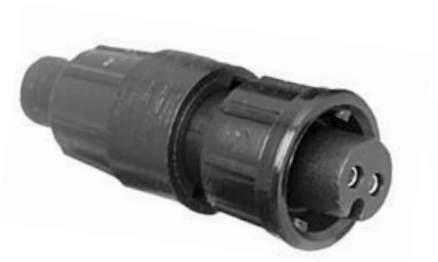
Cable Socket 1628X-XSB-XXX Matching Mates: • Cable-Cable 1828X-XPB-XXX • Panel 172XX-XPB-XXX