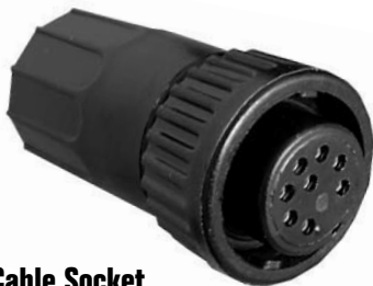
Cable Socket 3X8X-XSB-XXX Matching Mates: • Cable-Cable 5X8X-XPB-XXX • Panel 4XXX-XPB-XXX